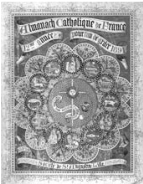
COVER OF THE ALMANAC WHOSE ORNAMENTS WAS REVIVED TO ACCOMPANY THE LETTERS

GERONTO IS A VERY SEXY CENTENARIAN COUPLE!