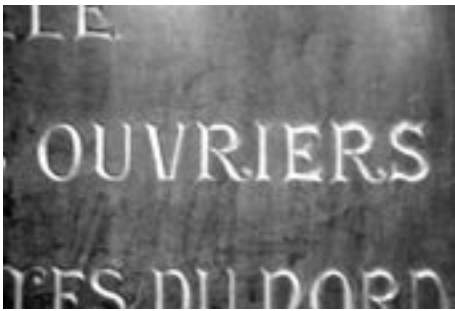
PHOTOGRAPH OF THE ORIGINAL ENGRAVED ALPHABET

GERONTO WAS AN OLD ALPHABET LOST IN A CHURCH OF LILLE WHO HAS BEEN REVIVED. HE WAS THERE, ALONE, IN A COLD AND DARK CORNER. I SAW HIM AND WARMED HIM WITH THE FRIENDLY FLASH OF MY NIKON CAMERA. THE SAME DAY, IN A FLEA MARKET, I MET SOMEONE WHO HAS BECOME HER ORNAMENTAL PARTNER. SHE WAS HERE AND THERE, IN THE PAGES OF AN OLD CATHOLIC ALMANAC OF 1891. I REPATRIATED BOTH OF THEM IN BORDEAUX WHERE THEY GOT MARRIED SOME MONTHS LATER.”